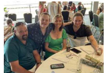
DSANT Annual Christmas Party - December 2022