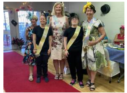
Casuarina Lions Floral and Fancy High Tea - August 2022