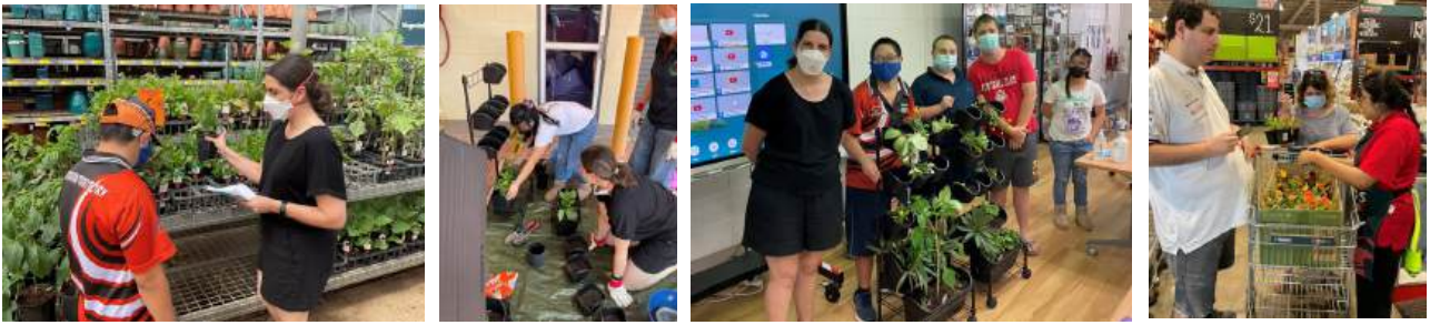
Nightcliff Lions Garden Project - September 2022