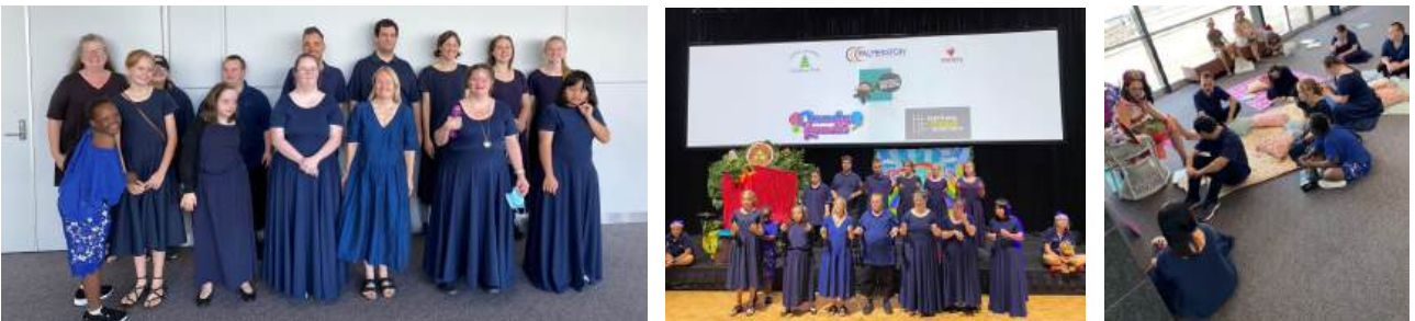
Special Children's Christmas Party Performance - December 2022