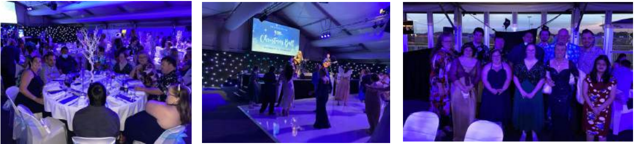
CDU Christmas Ball- December 2022