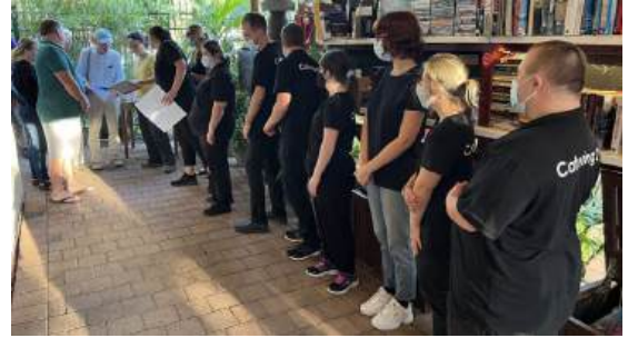
Deck Chair Cinema Fundraiser by DSANT & Catering21 - July 2022