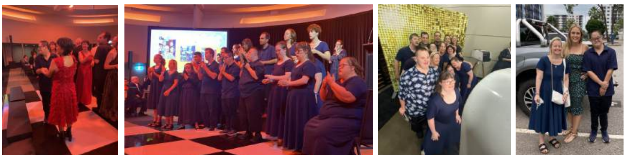
Casuarina Lions Club Op Shop Vintage Ball - April 2023