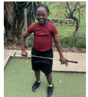
Down Syndrome Awareness Week - October 2022